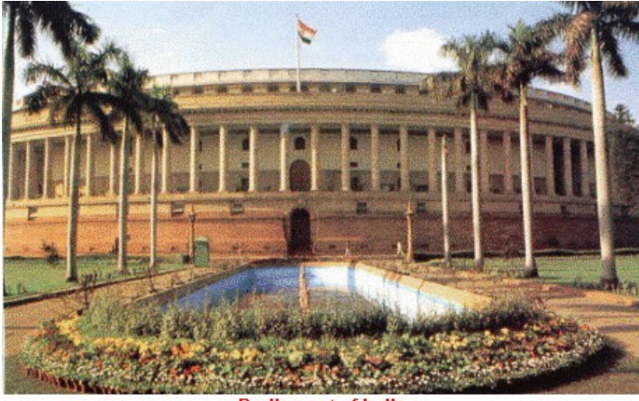
Parliament of India