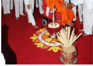
Bhagavan lighting 'Sai Vidya Jyothi'