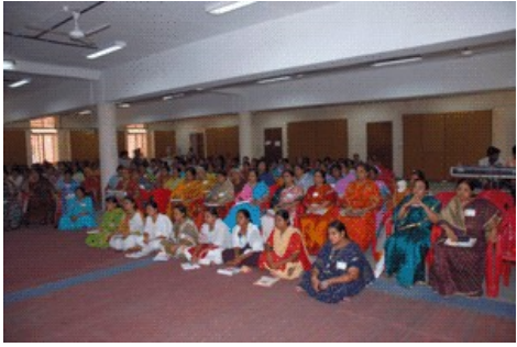
Indian Delegates in Sessions