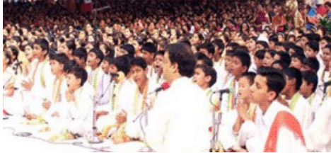
Children's Choir during Festival of Joy - October, 2005

3000 young kids from all over India had come to Puttaparthi to participate in a 3 day 'Festival of Joy' from the 22nd to the 24 th of October, 2005.