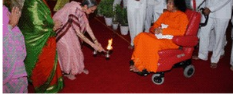
Bhagavan in 'Sai Vidya Jyothi' Exhibition