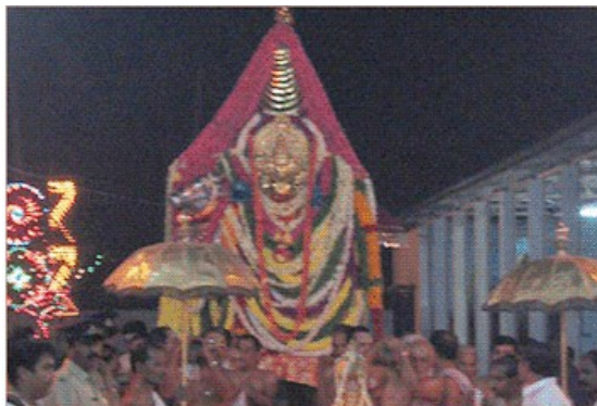
The lord being taken in procession

The Deity : Shiva - Vaikom Mahadevar manifests himself as Dakshinamurthy in the panthirathi pooja in the morning. He is worshipped as Kiraata Murthy during the Uchcha pooja at noon and as Satchitananda in the evening.