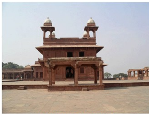
Fatehpur Sikri – Akbar's Capital

Akbar the Great Moghul emperor ruled Northern India from 1556 to 1605. He was a great leader, warrior, hunter, a lover of nature and the arts, expert sportsman and philosopher. Akbar was a multifaceted man - a master of all arts, yet one of his most revered qualities and greatest legacies was his great love for and practice of religious tolerance. Viewed in the context of the era in which Akbar lived this is all the more astonishing and impressive. In a time where wars constantly waged in the name of religion, prejudice was rife in many parts of the world and would remain so for hundreds of years, Akbar practiced an unprecedented kindness, compassion and reverence for many religious other than his own Muslim faith.