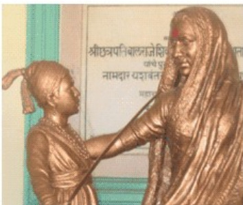
Jijia Bai with Shivaji