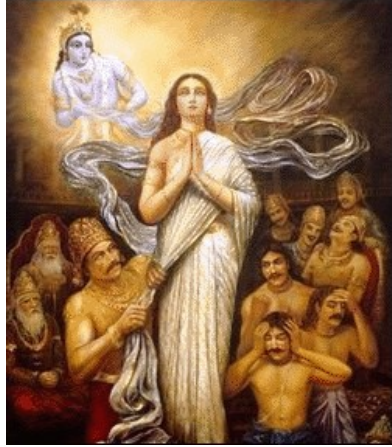
Draupadi in total surrender to Lord Krishna

Draupadi too was a great woman. She was always contented with what she had. She was always obedient to her husbands and would always find time to serve them. She had steadfast devotion to Lord Krishna.