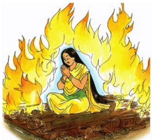
Mother Sita undergoing the ordeal by fire

Anasuya (wife of sage Atri) was put to test by God Himself. The Trinity of Brahma, Vishnu and Maheswara went to her in disguise and begged, Bhavati Bhiksham Dehi (mother, give us alms). When she was about to serve them food, they said that they would accept it only if she served them without wearing any clothes. Immediately, she transformed them into three infants and fed them as per their wish. She could transform even Brahma, Vishnu and Maheswara into small babies and play with them only because of her purity of heart and the power of chastity. Ultimately, Saraswati, Lakshmi and Parvati, the wives of the Trinity, begged her that their husbands may be returned to them. Anasuya, being one of compassion, yielded to their request. The Trinity blessed sage Atri and Anasuya, saying that they would be born to them in the form of Dattatreya. The name Dattatreya signifies one who is adopted by sage Atri.