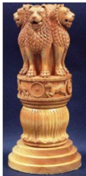
The lion capital of Ashoka

"In the history of the world there have been thousands of kings and emperors who called themselves 'their highnesses,' 'their majesties,' and 'their exalted majesties' and so on. They shone for a brief moment, and as quickly disappeared. But Ashoka shines and shines brightly like a bright star, even unto this day."