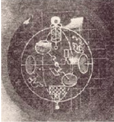
Draft first space ship by Konstantin Tsiolkovsky