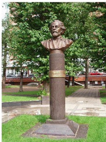
Monument to Konstantin Tsiolkovsky in Moscow

Tsiolkovsky stated that he developed the theory of rocketry only as a supplement to its philosophical researches. He wrote more than 400 works, most of which are little known to the general reader because of their questionable value.