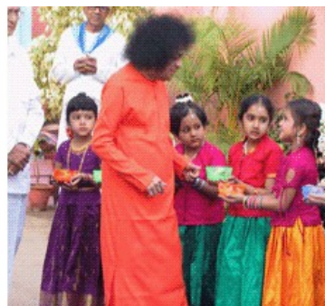
Swami with the Bal Vikas children during Easwamma Day celebrations in Brindavan