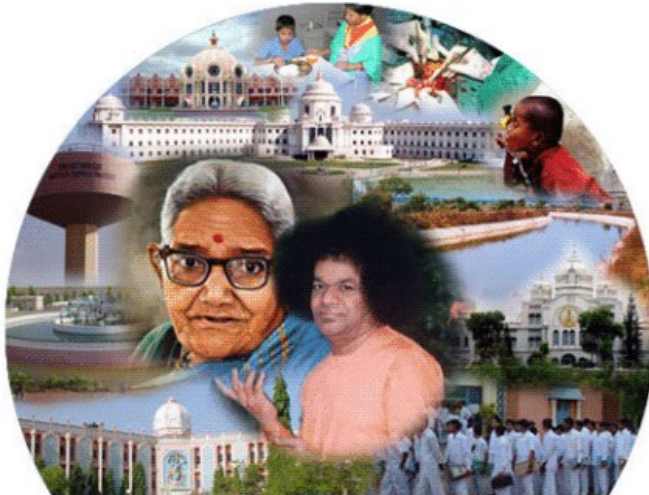
Her desires – Boons to mankind Educare – Medical care – Sociocare