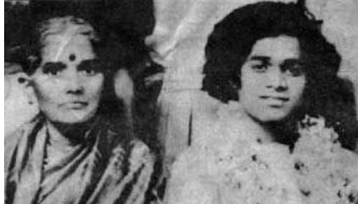
The loving God with his loving mother